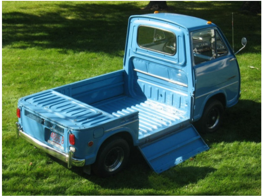
1969 Subaru Sambar Mini Truck

Please contact Tabettha Salsbury at 231.922.8837 or by e-mail at tsalsbury@hagerty.com