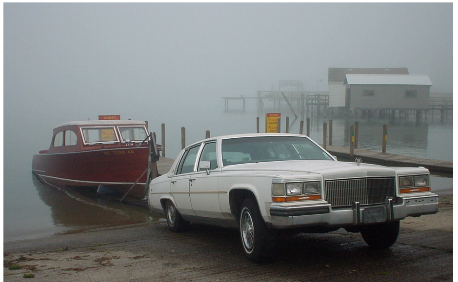
In different life, Ken Pepke escapes river the fog