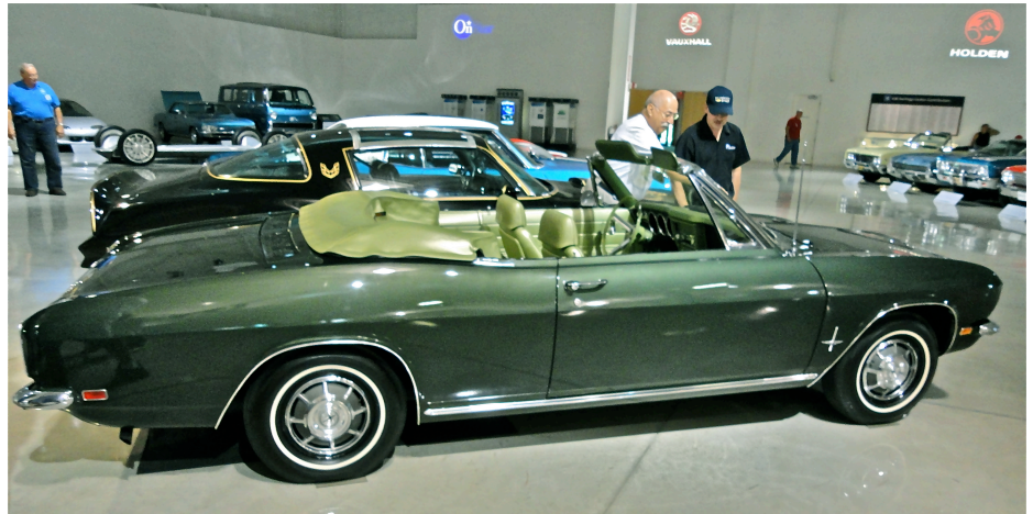
1969 Corvair on display at the GM Heritage Museum