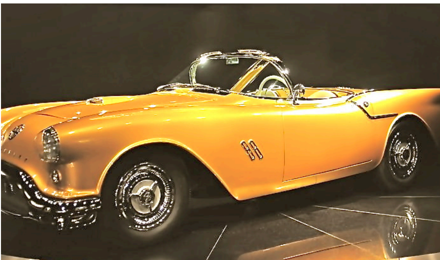
1954 Oldsmobile [remember them?] F-88 Concept / Show car.