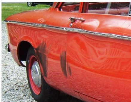
Damage to Corvair right side

“When a driver is being passed by another vehicle, the law requires the driver of the slower vehicle to maintain a constant speed and stay to the right until the other driver has safely passed.”