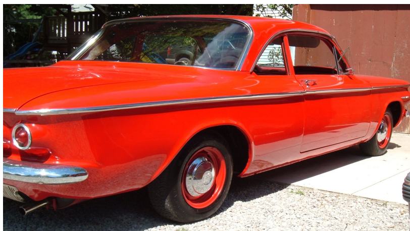
Repaired and the whole car repainted