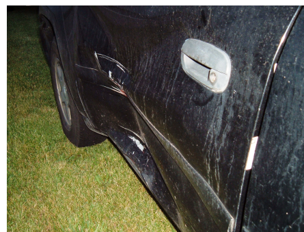
SUV impact in side area