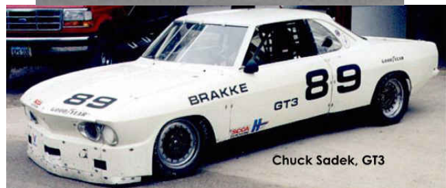
Chuck Sadek, GT3