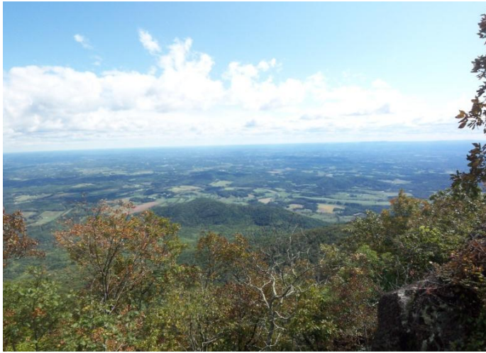
View from the Peaks of Otter