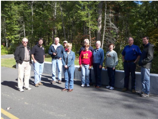
Most of the Goat's Milk Tour Group