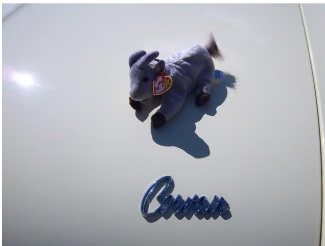
Our Goat Mascot