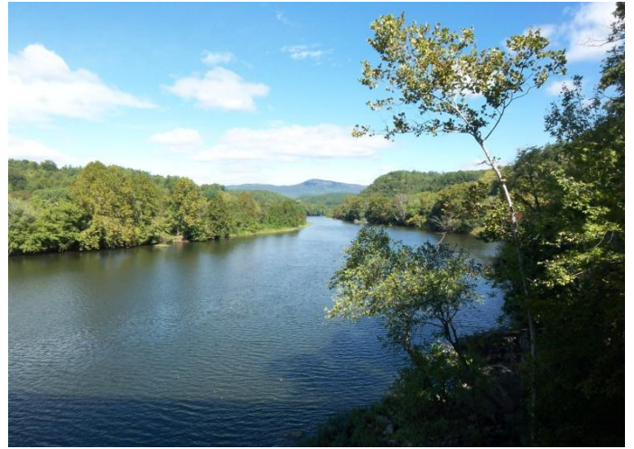
View of the James River at the Parkway Overlook