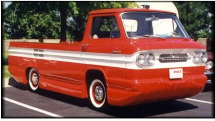
GM PhotoStore offers this attractive styling study known as the '1963 Spyder Show Truck.' It features a custom grille and special wheels.

Original plans were to buy 'Loadsides' in white and modify them to be amphibious. The only one produced came to the Homecoming some years back. Although it swims well it has traveled less that 130 miles.