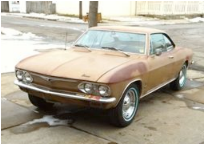
A little bodywork and it will be ready for some fresh paint ... what color becomes the question?