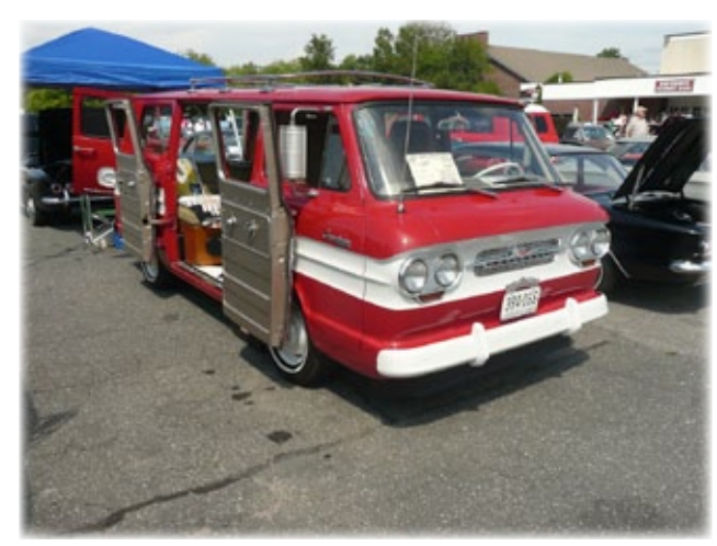
Greg Walthour's 1963 Greenbrier