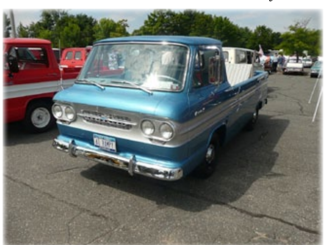
Phil Domser's 1963 Rampside