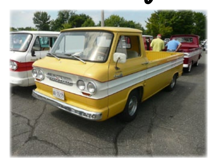
Unidentified 1962 Rampside with Ontario Plates