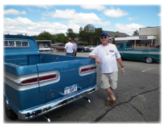
Awarded Gold in Concours