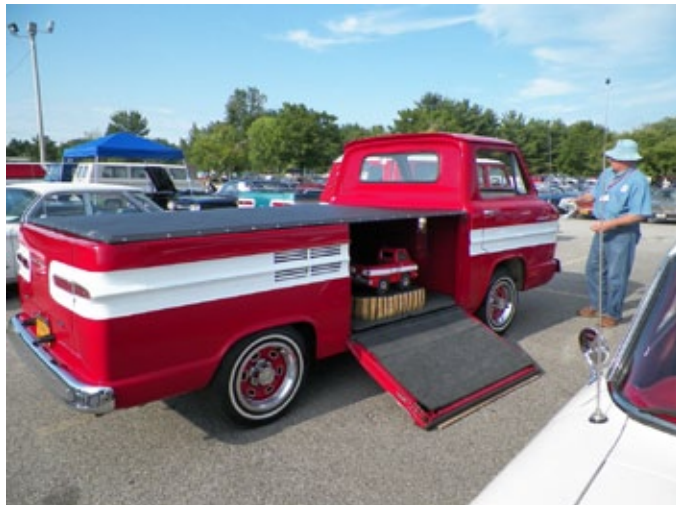
Fred Marsh's truck came with it's own Mini-RampMe