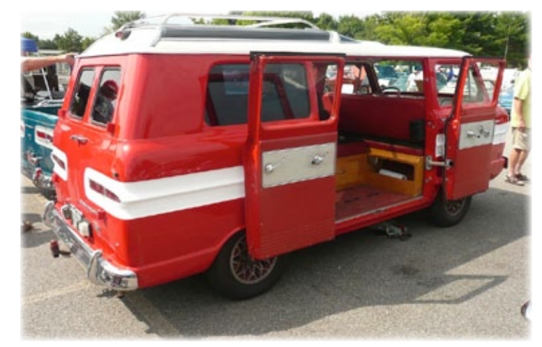
Larry Claypool's 1963 Greenbrier camper