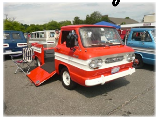
Awarded Silver in Concours