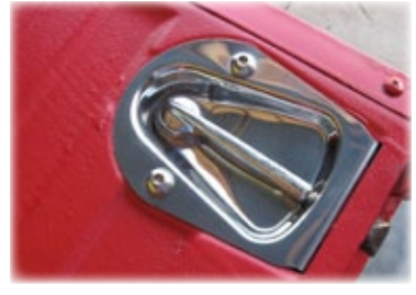
Here is a example of one of Dann Weinoe's polished stainless steel latch shells. This was installed using the existing mechanism and handle. Dan will be selling complete units soon. Stay tuned for further information.