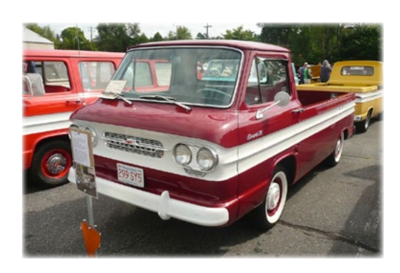
Cal Clark's 1961 Rampside