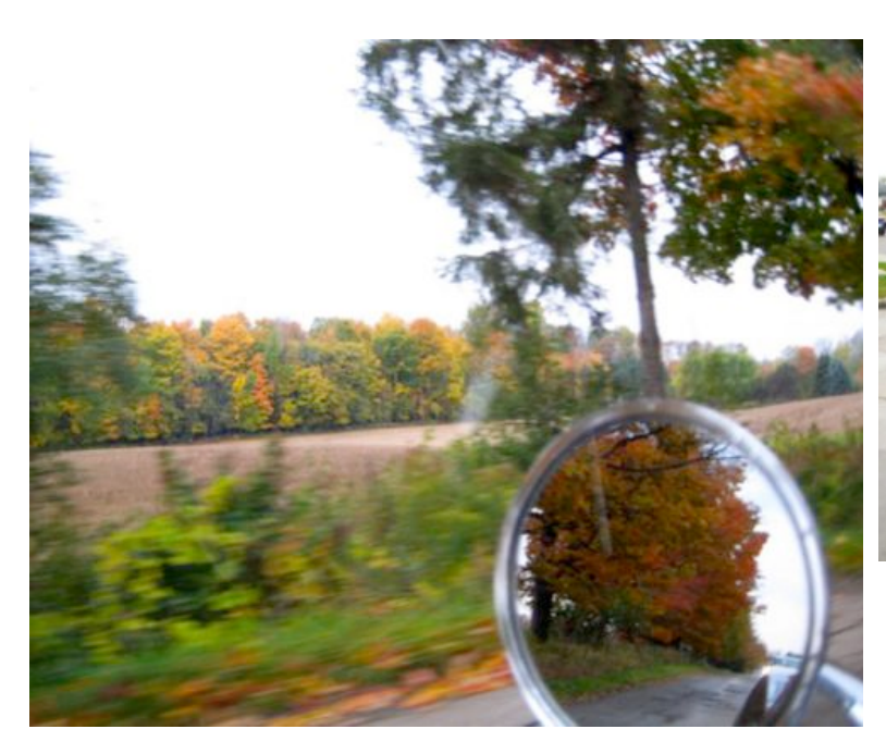
Fall colors coming and going