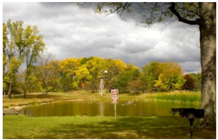
Heritage Park Picnic Site with the sun shining