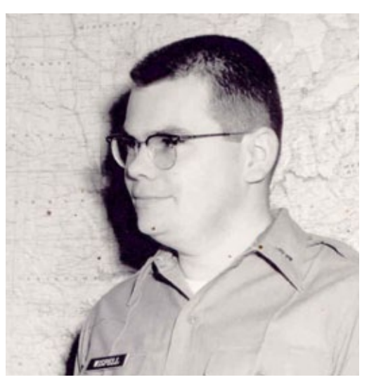
1960, 25 year old Second Lieutenant

Dallas Naval Air Station Research and Development Unit (active reserves).