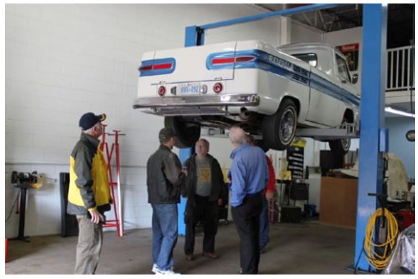
Continued See Rampala on page 5