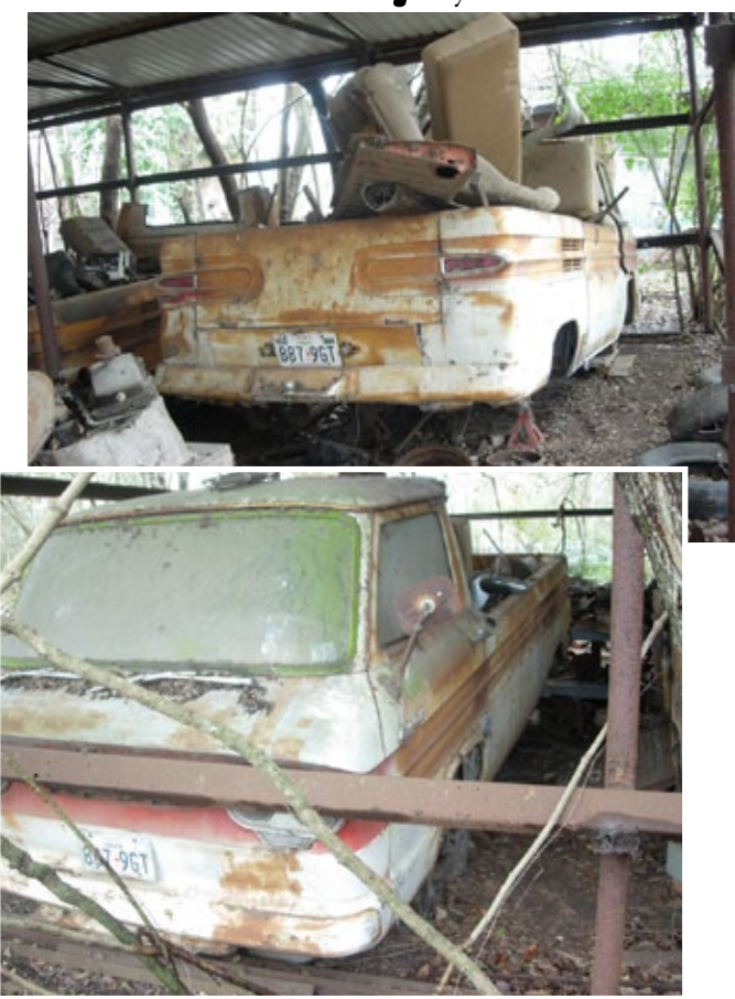
Waiting patiently for over 20 years this 1962 Rampside was rescued by David Brown of Wimberly TX.

One current problem is trying to rescue a set of 80hp heads to use on my engine. I removed another 80hp engine from a parts Rampside, but as the picture shows, there was a nice multi-generational mouse/rats nest under the shroud. I am told that the urine from those dwellers helped to 'weld' the heads to the cylinders. After several months of soaking with penetrating oil, I pounded several wooden 2 x 4 blocks into obliteration with a 4 lb. sledgehammer in an effort to remove the heads, but no luck. The heads are not hard to find, so I may bite the cheap bullet and send this engine to the scrap yard! At any rate, if work allows, I plan to have this Rampside on the road before the end of this year. Once running and useful, I'll then start on the body.