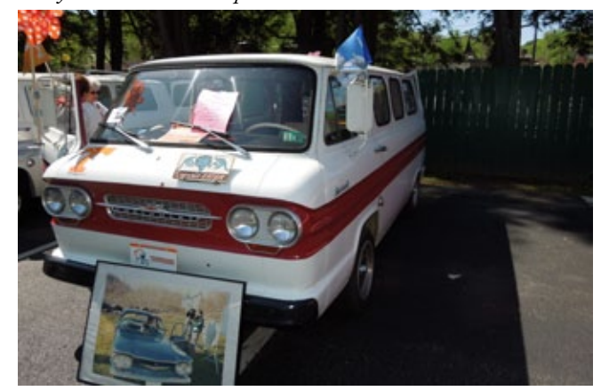
Donnie Bird 1963 Corvan