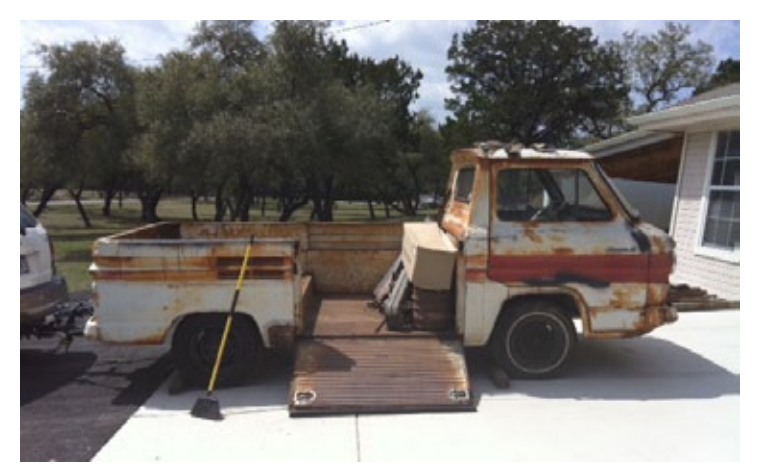
The Rampside safely home and cleaned out.

I was able to acquire from Mike, a very nice original late model 'hole-thru-the-middle' gas tank and all the late shifting links, shafts, etc., so I will update it to the late shifter as well. The front end has been cleaned & repaired & everything underneath has been checked & replaced as needed, including new brake & fuel lines that I made myself.