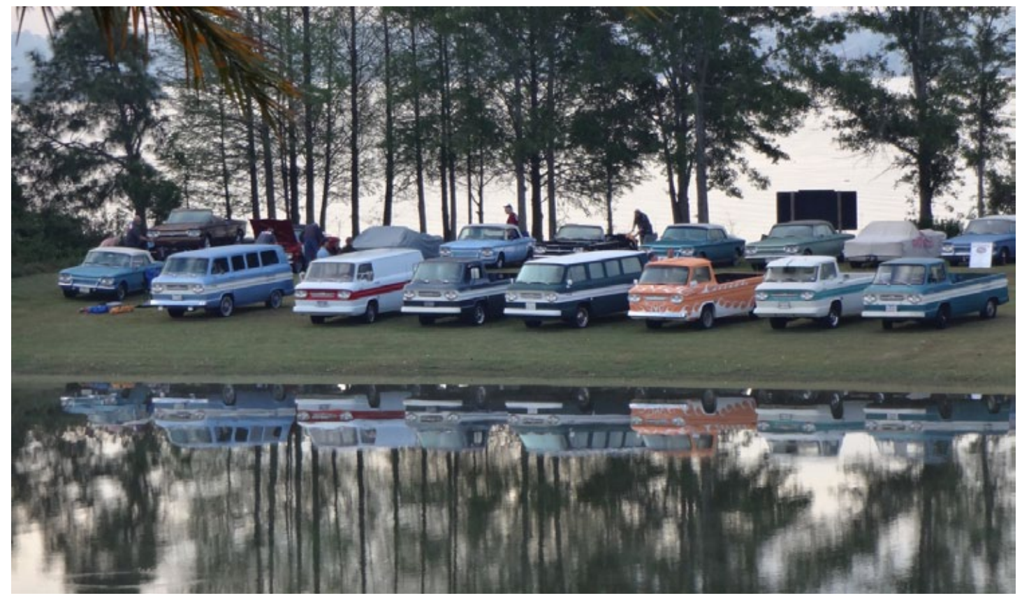
2013 Heart of Texas at La Torretta Resort and Spa in Montgomery, Texas on Lake Conroe. With the FCs up front.