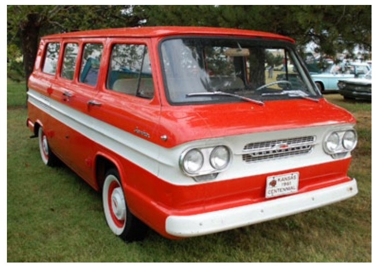
Terry Kalp's very low mileage and early build 1961 Greenbrier.