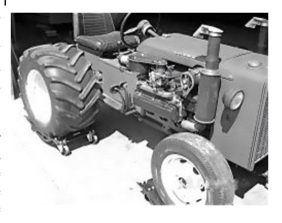
Corvair powered lawn tractor