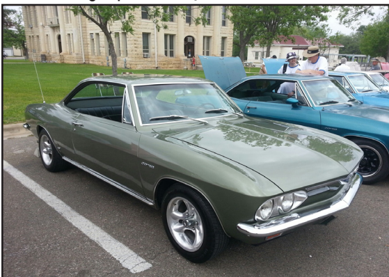
Matt Feehery's '66 Corsa takes late closed