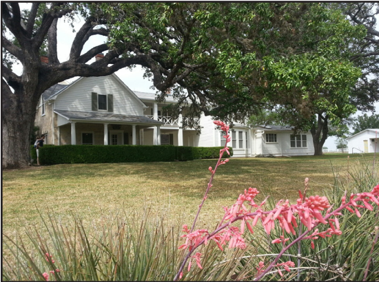
The "Texas Whitehouse" at LBJ Ranch