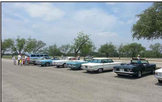
The group at the LBJ ranch Tour