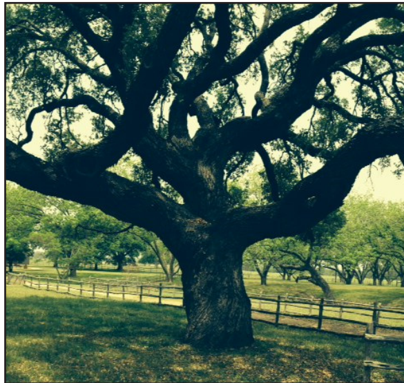
500 Year Old Live Oak at the LBJ Ranch

Many members were up with the sun to catch breakfast, wash our Corvaairs, and drive to the Johnson City courthouse square for the morning car show. The courthouse square was well-shaded and a great location for a car show. As usual, many older people remembered the Corvaair, and had had one, or knew someone who had one, and the younger ones were flabbergasted to find the engine in the trunk. With so many nice Corvaairs of the 42 in the show, it was Continued on Page 4