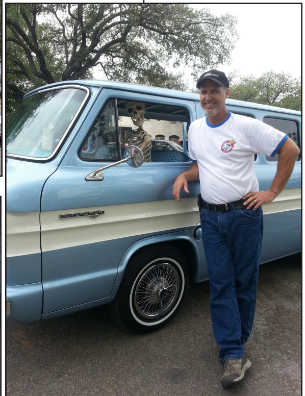
The Murphy's '65 Greenbrier takes Best in Show