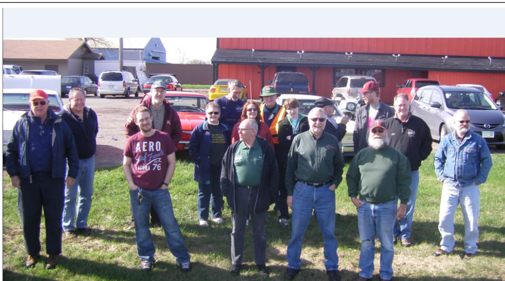
A bunch of CMLers for AAH daze