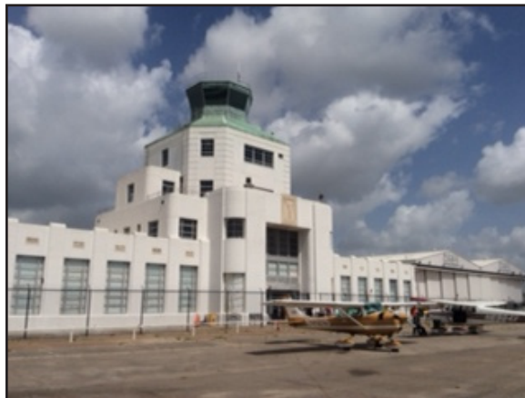
1940 Hobby Air Terminal Museum

After dark, we moved the lawn chairs out to the dock to watch the Fireworks over the lake including some new ones that none of us had ever seen before. And, although we were sitting by the water it was an amazingly mosquito-free evening, but Corvair Houston is a good-luck group!