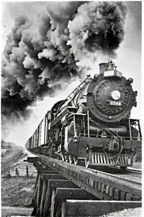
HISTORICAL PHOTO OF THE MONTH GTW 3748 NEAR MUSKEGON