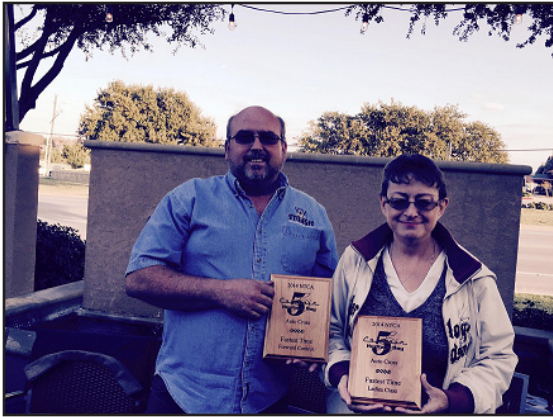
CHD V Autocross Winners in FC Class