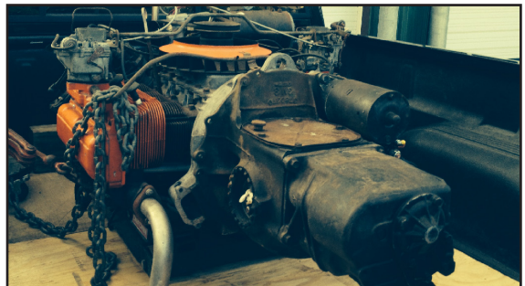
Display engine built by Gary and donated to CH