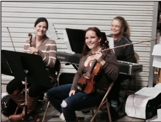
Musical Entertainment at the November Club meeting