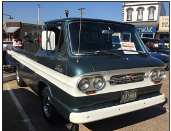
Photos from Bellville Show (sponsored by the Austin County Cruisers Car Club)