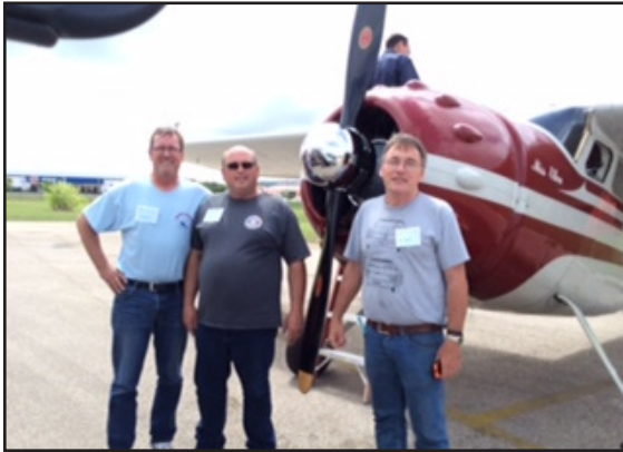
Corvair Aviators at HOT 2015 in Burnet, TX