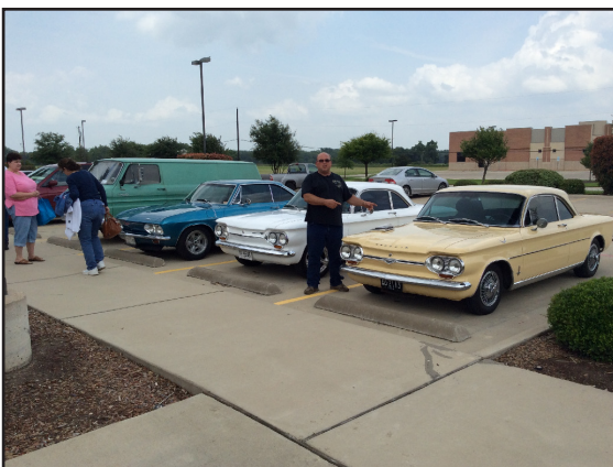
Photos from 7th Annual Dewberry Fest in Cameron Beautiful Courthouse shown in photo on right

Driving a Corvair is not required. I am told the train people love Corvairs. It would nice to display some of our cars to the people that love mechanical things and the public. I hope to see everybody at the meeting and the event.