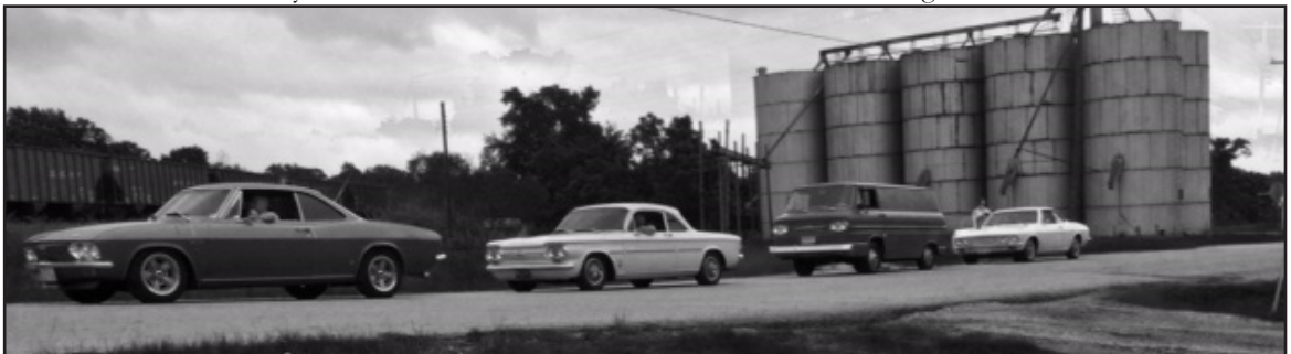
Classic black and white photo taken in route to the Dewberry Festival