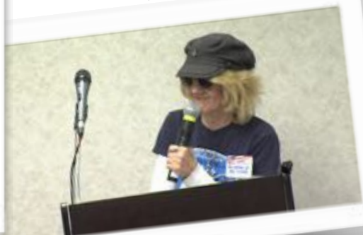
Corvair Lady hosting event