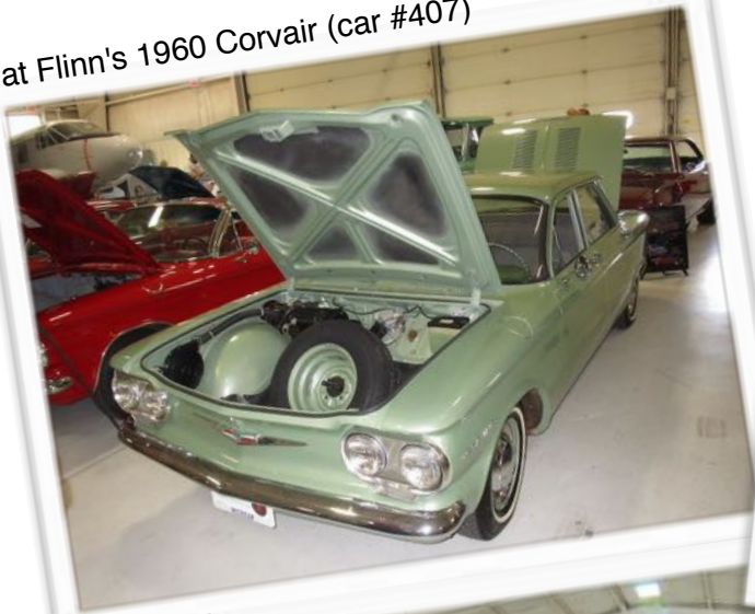
Pat Flinn's 1960 Corvair (car #407)