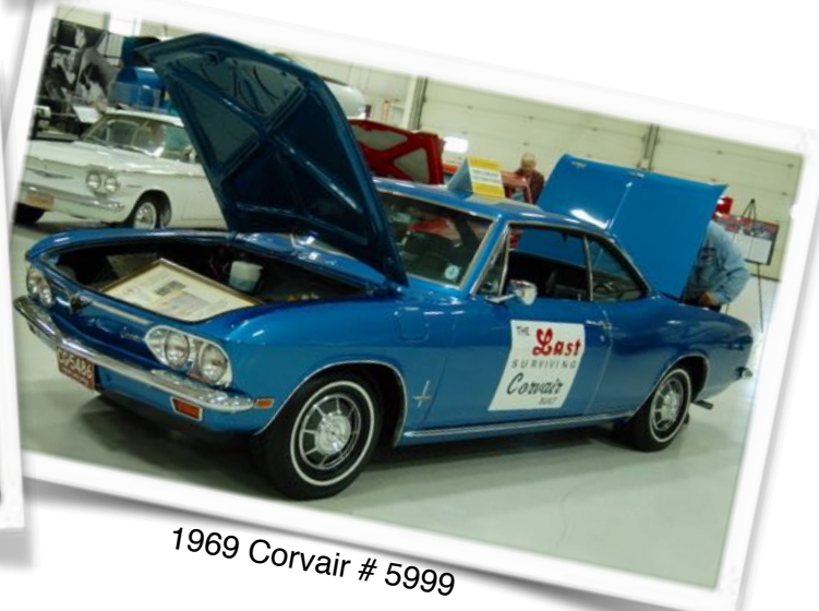
1969 Corvair # 5999