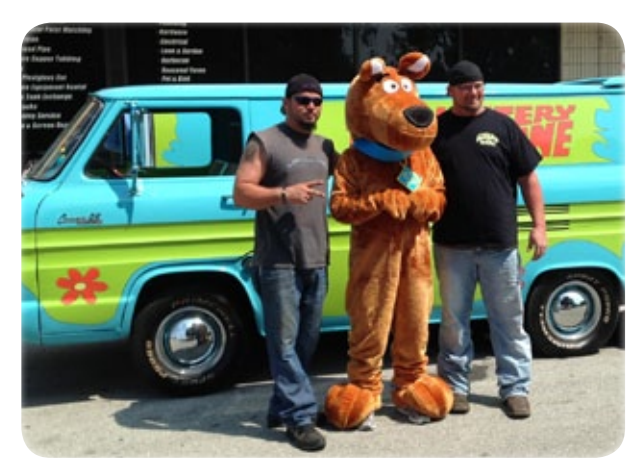
Even these two tough guys have a soft spot for Scooby.

Thanks to everyone that could come out for the car show and dinner.