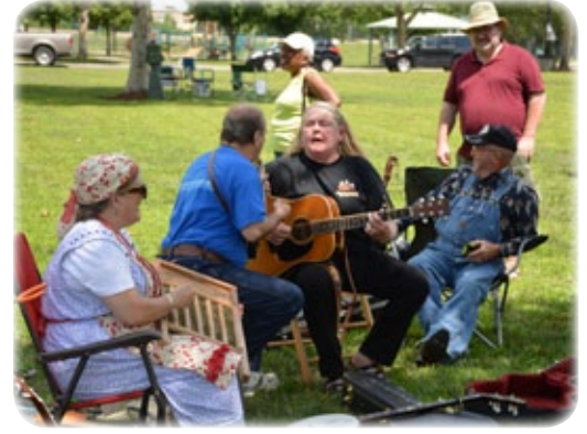
Bluegrass wasn't limited to the pavilion; several jam sessions popped up around the park.

The jamboree, held in E.H. Young Riverfront Park in Riverside, MO, is a combo bluegrass music festival and classic car show with a 1930s theme. Of course there were many Model A Fords, a few Model T's on display. All classic cars were welcome, and the diversity of cars ranged over many decades.