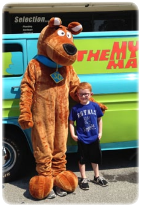
The redheaded kid followed Scooby around for an hour. He examined the Mystery Machine and pointed out a few things that needed fixing. He is going to grow up to be an engineer.