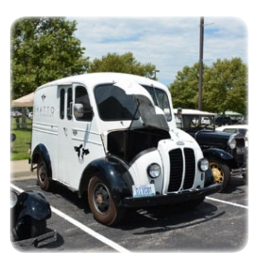
Shatto Dairy had a booth and displayed their 1954 Divco milk truck.

The event was well-organized and fun. When it comes back next year I recommend it. Good food, great music and a great spot to socialize.