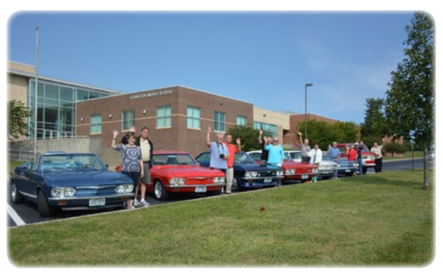
It was a great day for a Sunday drive across the orchard country of central Missouri. The best part was every HACOA member arrived in a Corvair.