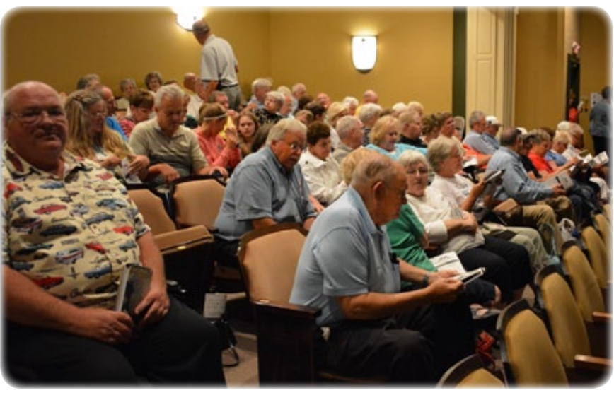
The Show-Me and HACOA members filled two rows at the Lyceum. The play, "Driving Miss Daisy" was excellent.