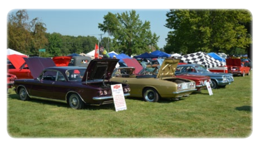
We weren't able to park all our Corvairs together this year. The Cruisers promised that next year we will have a reserved spot.