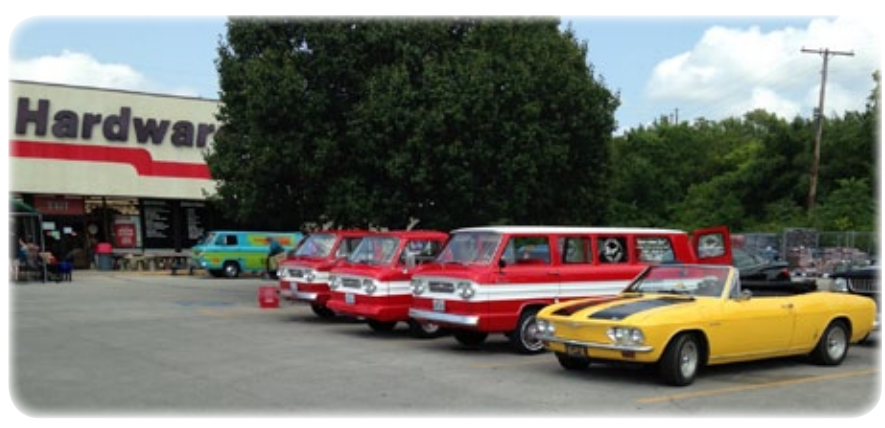
Corvair Forward Controls on display: one each Greenbrier, Loadside, Rampside and Corvan (The Mystery Machine).