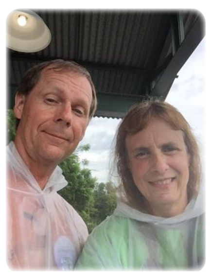
Greetings from the HACOA Presidential Retreat.