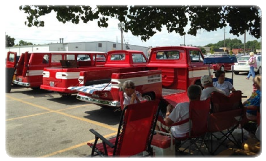
A perfectly placed shade tree and a breeze made for a pleasant afternoon. Some of us took advantage of the nearby Indian Creek Bike/Hike Trail to get some exercise.