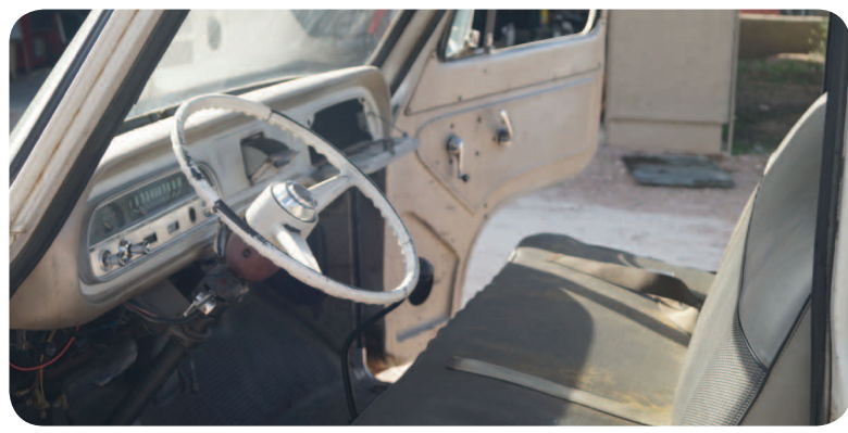
The interior went through a major restoration.