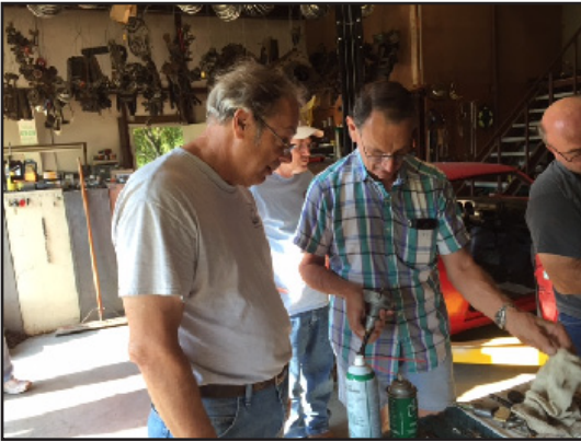
Work Day on the club autocross car at the Fox's shop.