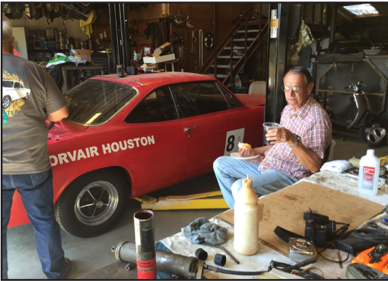
Work Day on the club autocross car at the Fox's shop.