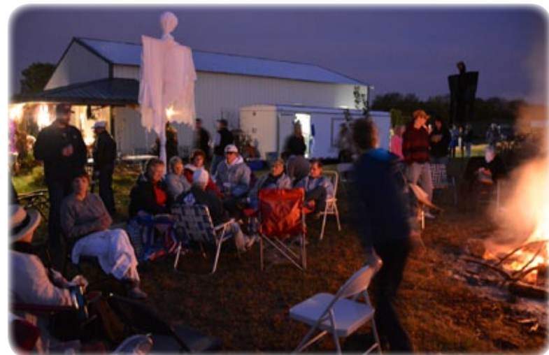
As promised, a bonfire was kindled to keep everyone warm.