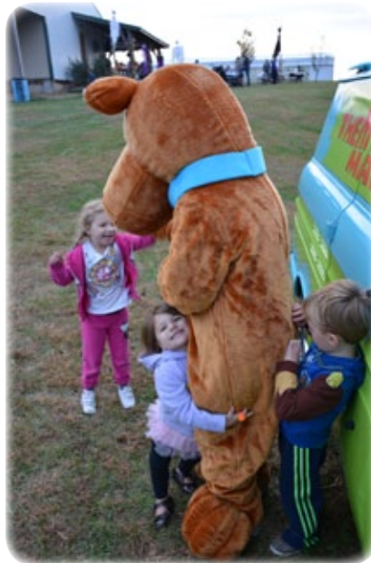
Scooby was a hit with the kids, though one youngster did examine the zipper down Scooby's back.