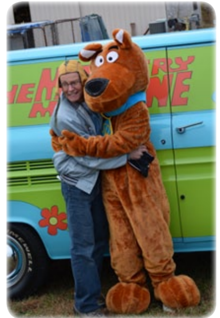
One of the "kids" wearing an Aviator's Helmet got a hug from Scooby.