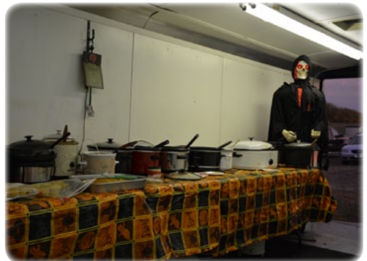
The 28' trailer served as a buffet line for more than 16 crock pots of chili and all the fixings.