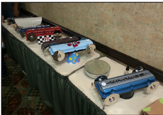
Valve Cover Racers at Corvair Heritage Day VI