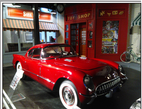
1954 Corvair Concept car