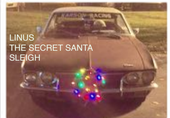
LINUS THE SECRET SANTA SLEIGH