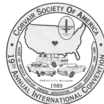
The 1989 CORSA Convention Logo

This will be hard work, but thanks to the experience we've gained taking our turn hosting the Great Plains Corvair Round Ups, I think we are well prepared.