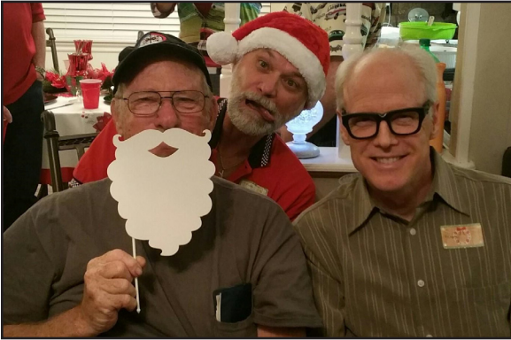
Fun time at the Christmas Party