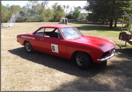
The Club Autocross Car is for sale!!