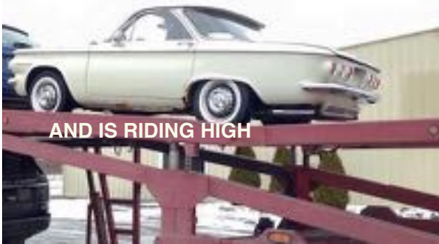
AND IS RIDING HIGH