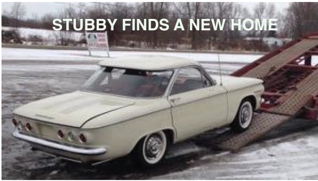
STUBBY FINDS A NEW HOME