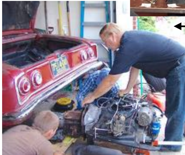
CAVEMAN IN HIS LAIR