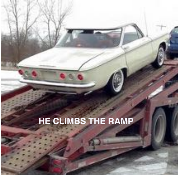
HE CLIMBS THE RAMP