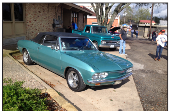
Photos from the Classic Car Stampede in Bellville - also see cover photo