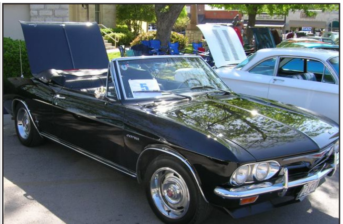
Charles & Joy Blanton's 1965 Corsa at HOT 2008