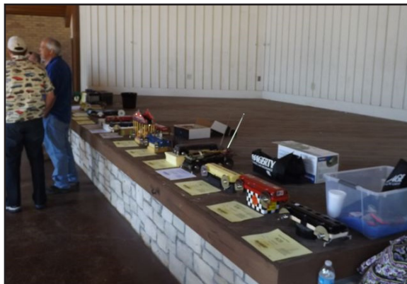
Valve Cover Racer display