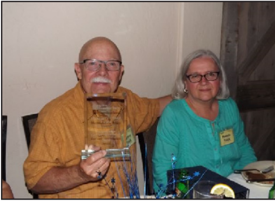
Best of show award winners from HOT 2016