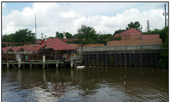
Photos from the Houston Ship Channel Tour