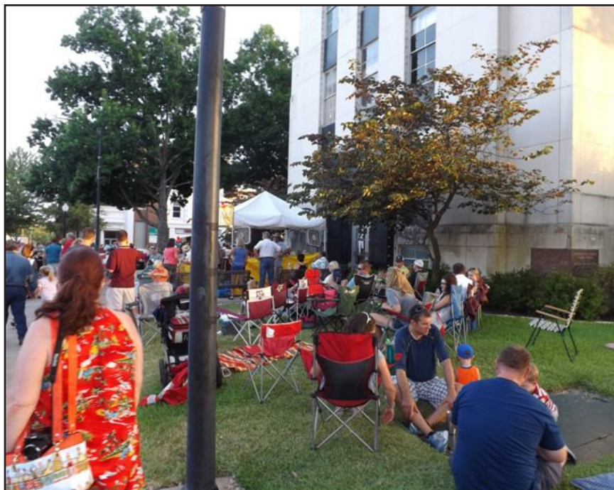
Cool Tunes / Hot Nights in Brenham, TX