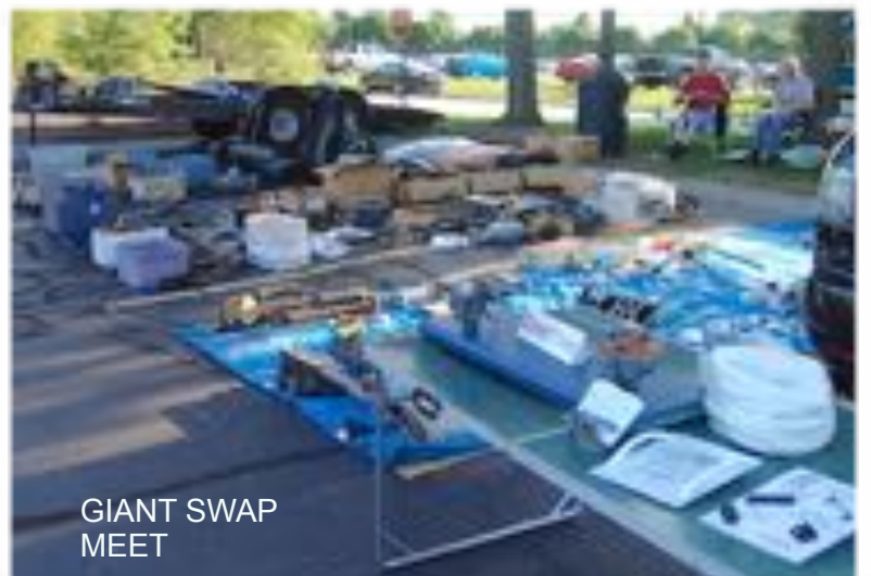
GIANT SWAP MEET