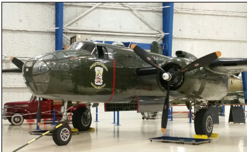
Doolittles Raiders plane from the Flight Museum