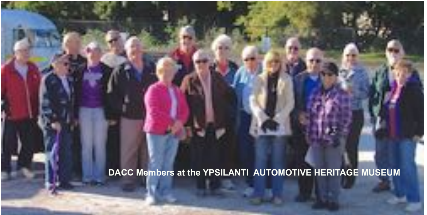
DACC Members at the YPSILANTI AUTOMOTIVE HERITAGE MUSEUM