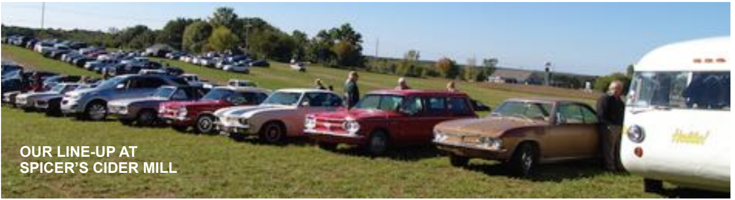
OUR LINE-UP AT SPICER'S CIDER MILL