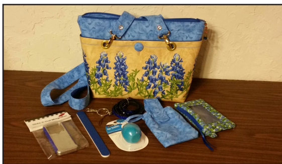
HOT Raffle Item - Bluebonnet Bag (B. King donation)