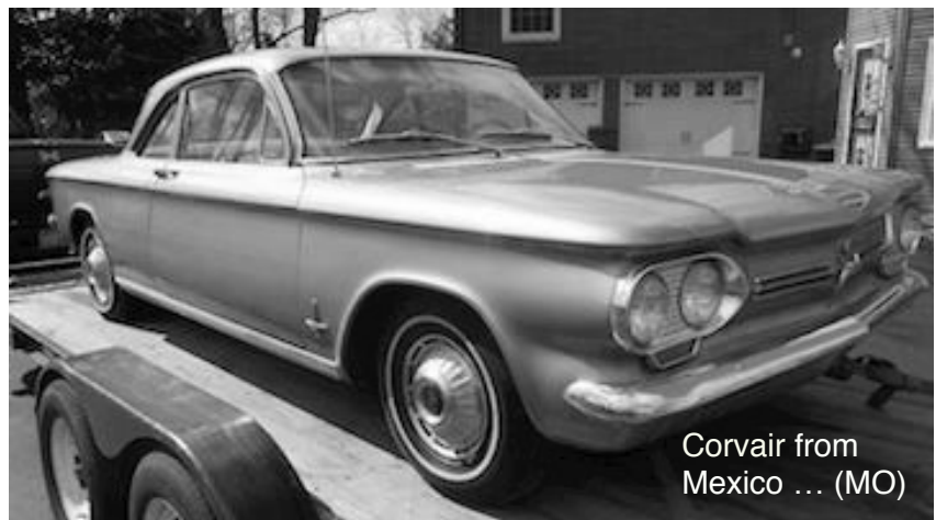
Corvair from Mexico ... (MO)