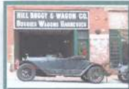
Featured Exhibit: Unrestored Vehicles Special show parking for qualifying vehicles

Antiques & Classics Street Rods Trucks & Buses Motorcycles Sports Cars