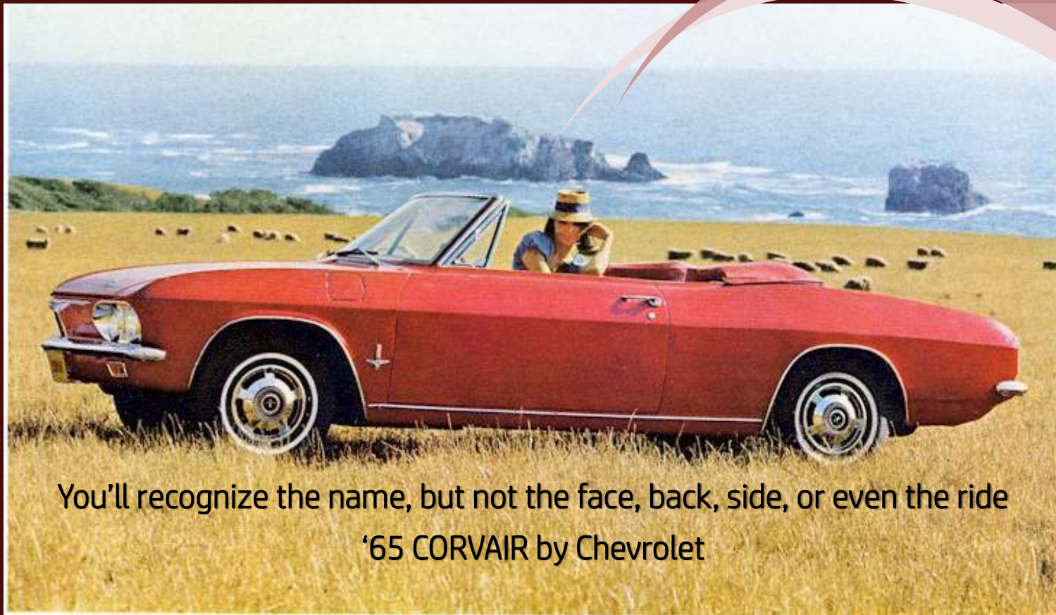
You'll recognize the name, but not the face, back, side, or even the ride '65 CORVAIR by Chevrolet

It's a longer, wider, roomier, sportier Corvair this year. About the only thing that's back is where the engine goes-and you can even have that with more power.