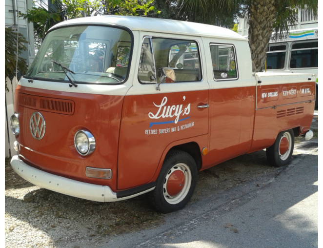
As seen in Key West (what?! – this isn't a Corvair??)

..... CMI is a non-profit corporation, chartered with The CORVAIR Society of America. Send CORVAIR Minnesota's $20.00 annual dues, payable by Jan 01, to the CMI Treasurer. Membership in CORVAIR Minnesota entitles you to the monthly newsletter, "The Leeky Seel", with free ads for members, a club window sticker, discounts on club activities, information on parts availability, and good advice on the preservation and enjoyment of the CORVAIR automobile.... Yeah!