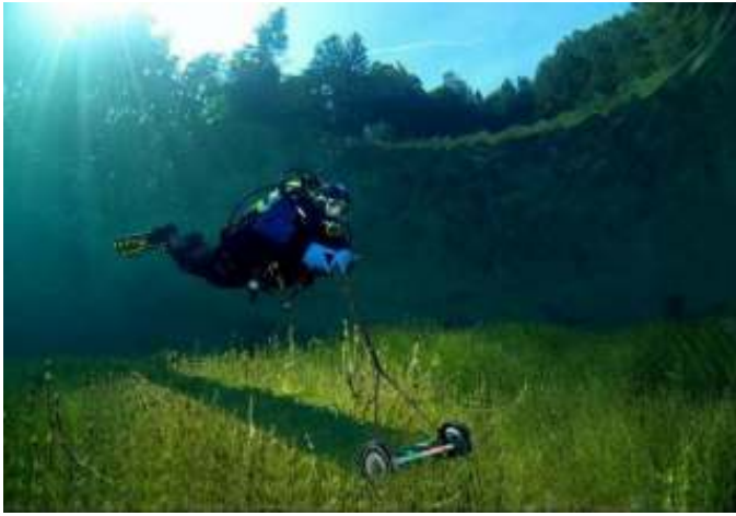
Finally was able to get out and mow the lawn. Did you get yours done? Last year, we were at the start of a draught. This year.....not so much.