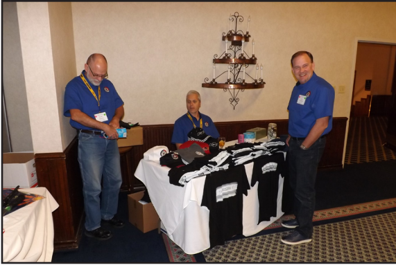
A sharp looking group wearing their new club shirts