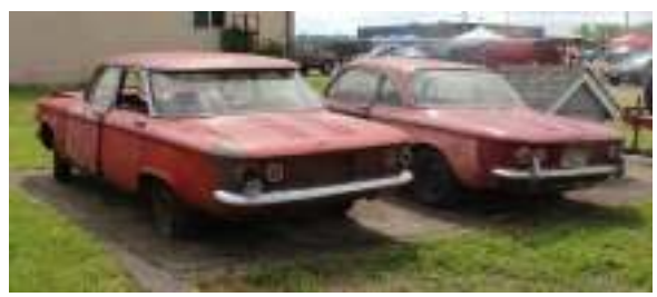
Spotted for sale at Wilson Cruise and Swap Meet

Pat Murphy sent me a bunch of pictures from an early season car show out of state, will have to wait until next month, had a lot to use this month!