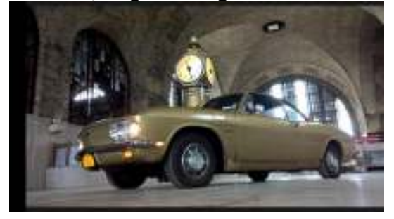
For Sale: 66 Corsa Turbo Coupe Sam and Marissa Andolino's car http://dodgebird.blogsite.org/wordpress/201 4/05/1966_corsa_turbo/