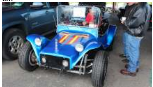
Saw this baby for sale at Dunkirk, $4500 with Corvair 140 motor, and wheelie bars!