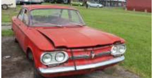
4-door $1700, Coupe just $1000