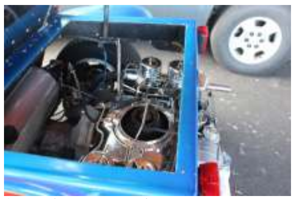
At Dunkirk, what a steal!