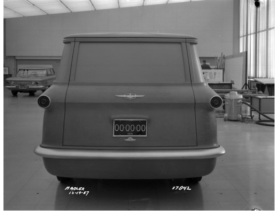
It intrigues me that this particular design study used a single rear door. Where have I seen that before?

http://tylerlinner1.kinja.com/design-history-1961-65chevrolet-corvair-greenbrier-1786876388