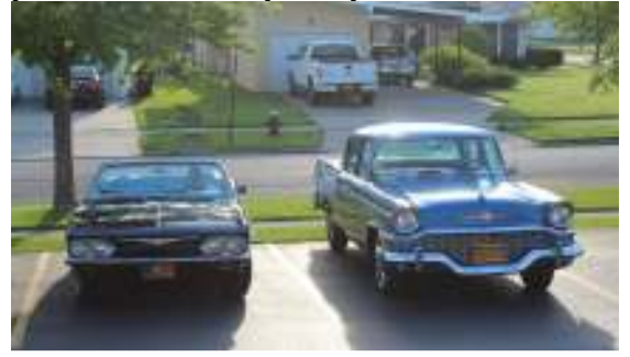
A few members brought out their cruisers for the May meeting at the Church!