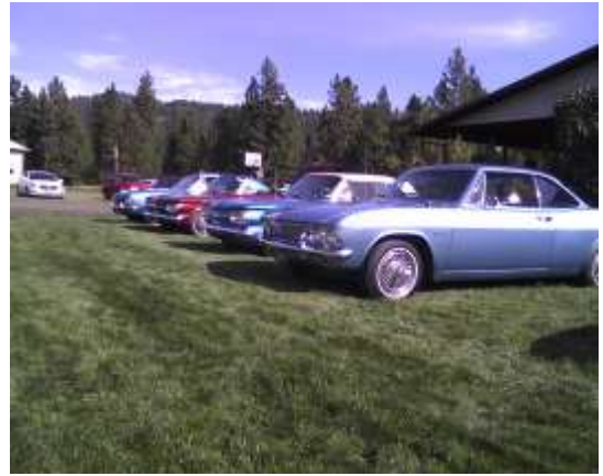
Corvairs on display at the 2013 Cider Fest

INCC Christmas/Holiday Party (Date, Hosts, and Location TBA)