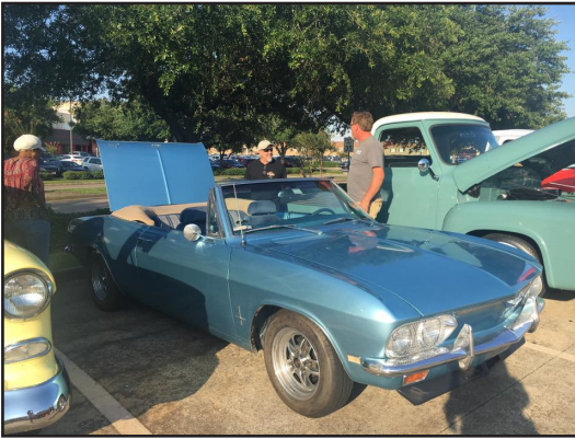
Todd Hasfjord at the Otto's Car show in Sugar Land